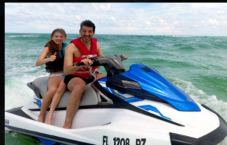
WATER SPORT ACTIVITIES