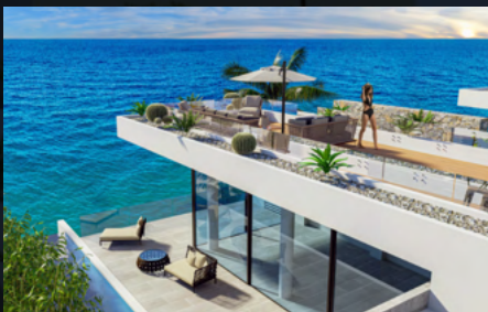
BREATHTAKING SEA VIEWS

In recent times, the property market in North Cyprus has witnessed a remarkable and flourishing surge, providing international investors with amazing opportunities for growth and prosperity. From unparalleled Capital Appreciation gains, flexible payment plans, high Returns on Investment, and untapped Market Potential, North Cyprus is proving to be the best location for Investing . We would like to walk that journey with you, from beginning to end.