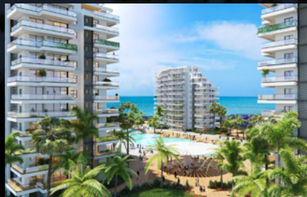
5-STAR BEACHFRONT RESORTS