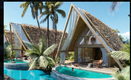
PARADISE ON AN ISLAND